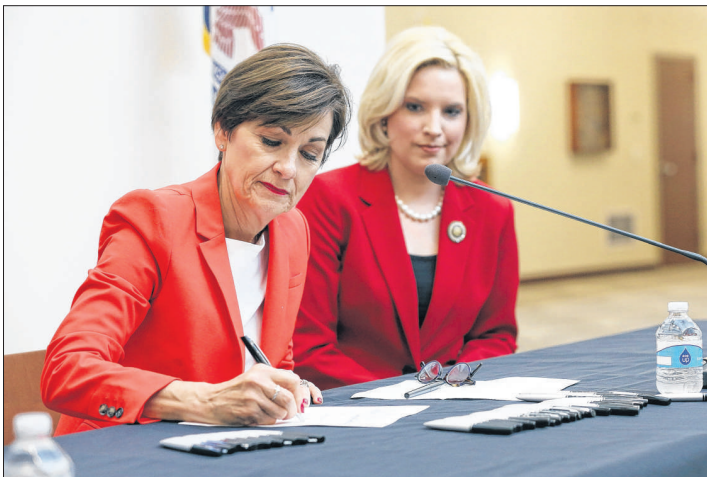
Gov. Kim Reynolds signs a bill Monday as state Rep. Ashley Hinson, R-Marion, watches at the Educational Leadership and Support Center in Cedar Rapids. Hinson introduced legislation that became House File 637, which among other things requires school districts to make a report to the Board of Educational Examiners within 30 days of taking disciplinary action against a certified employee.